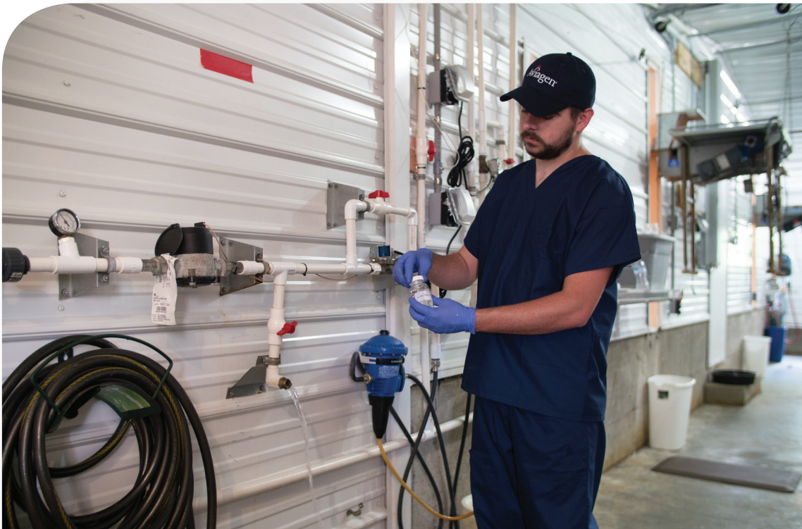
Sampling at the entrance of the house

Water disinfection during production is an integral part of a good flock management program. Controlling bacterial contamination and biofilm formation in the drinking system is key to reducing bird exposure to harmful organisms and minimizing the spread of disease. If allowed, chlorination is an effective way to achieve water sanitation, as it provides residual protection against recontamination, is easy to use and cost effective.